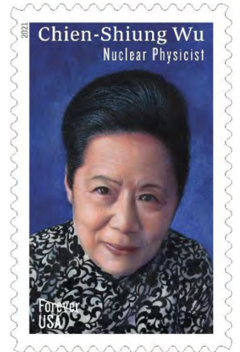
US Postal Service stamp recognizes nuclear physicist Dr. Chien-Shiung Wu.