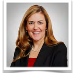
Congresswoman Jennifer Wexton, Guest Speaker.

Saturday, December 14, 2019, Noon River Bend Country Club 375 Walker Road, Great Falls, VA