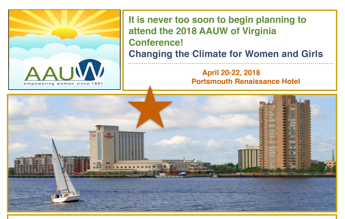
Location, Location, Location!

The Renaissance Hotel sits on the Elizabeth River flowing between Portsmouth and Norfolk.