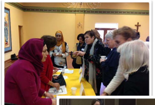
Photo Gallery I January Branch Meeting on Leadership of Women in Islam