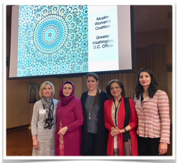
Leaders from the Greater Washington, DC Area Office of the Muslim Women's Coalition shared their experiences with initiatives to build strong interfaith relationships.