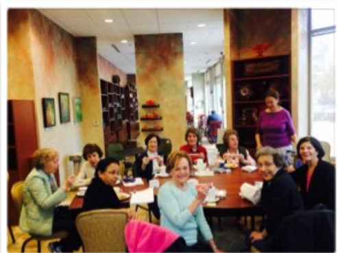
Most of the members who attended Equal Pay Day.