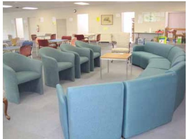
The spacious third floor sorting site at the Sun Trust Bank