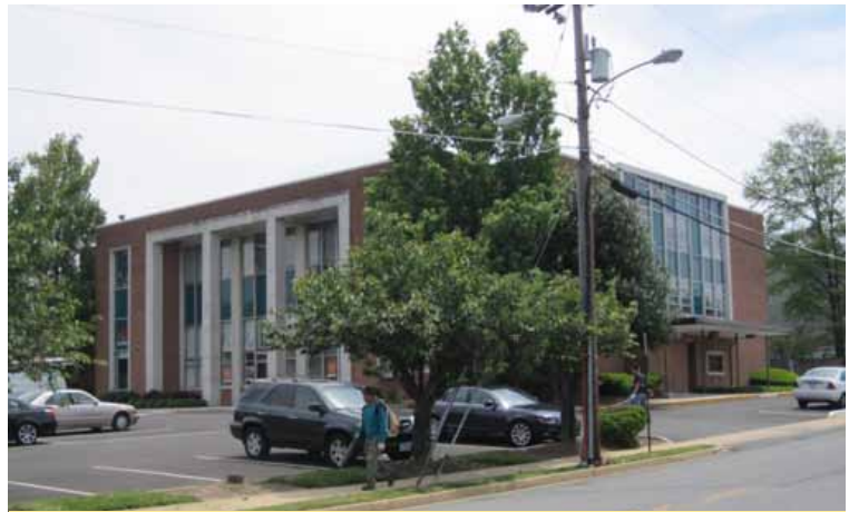
Sun Trust Bank, 515 Maple Ave East, Vienna